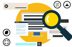
-Information on MSDs in Dentistry