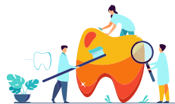
-Introduction to Dental Ergonomics