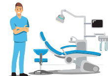
-How to plan exercise program for dentists