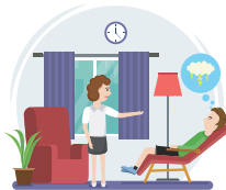
-Various stress relaxation techniques