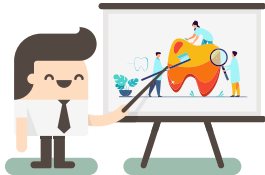
Introduction to ErgoDentFit Program