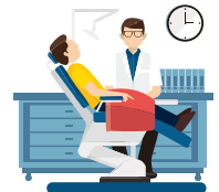
-Mistakes done by the dentist in the operator